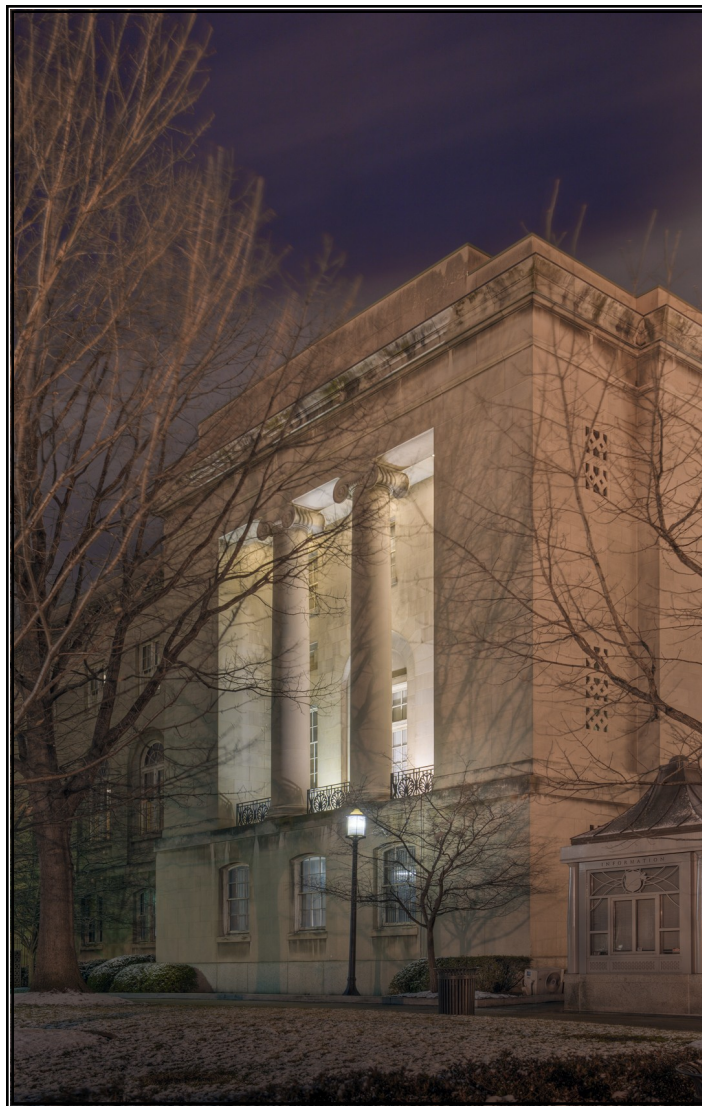
A winter scene of Building A of the DC Courts