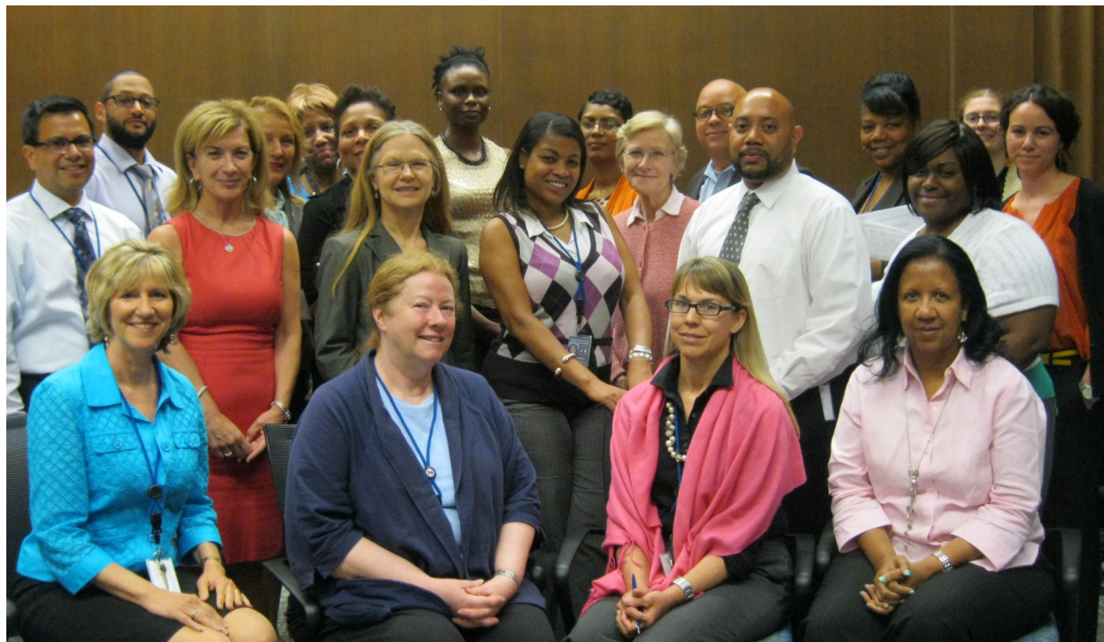
Members of the Multi-Door Dispute Resolution Division staff with the Director in June 2013.

Court-ordered arbitration, as it operates in the D.C. Superior Court, involves an impartial third party (the arbitrator) who meets with the parties, listens to presentations of both fact and law, and renders a