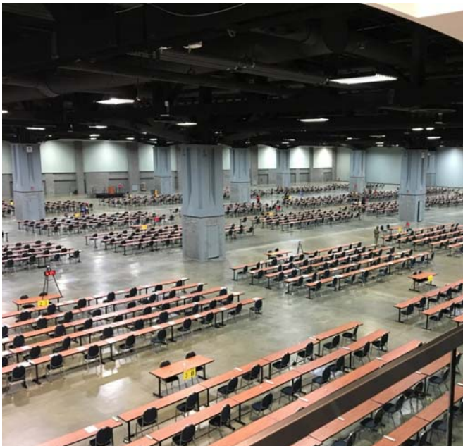
(set-up of the Convention Center's Lower Exhibit Hall in advance of the bar exam)