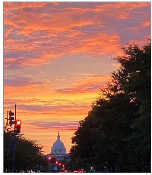
Above: U.S. Capitol Building at sunset

Editor: Lizbeth Carrillo 410 E St. NW, Suite 2900 Washington, D.C. 20001 202-879-2944 Lizbeth Carrillo@dcsc.gov