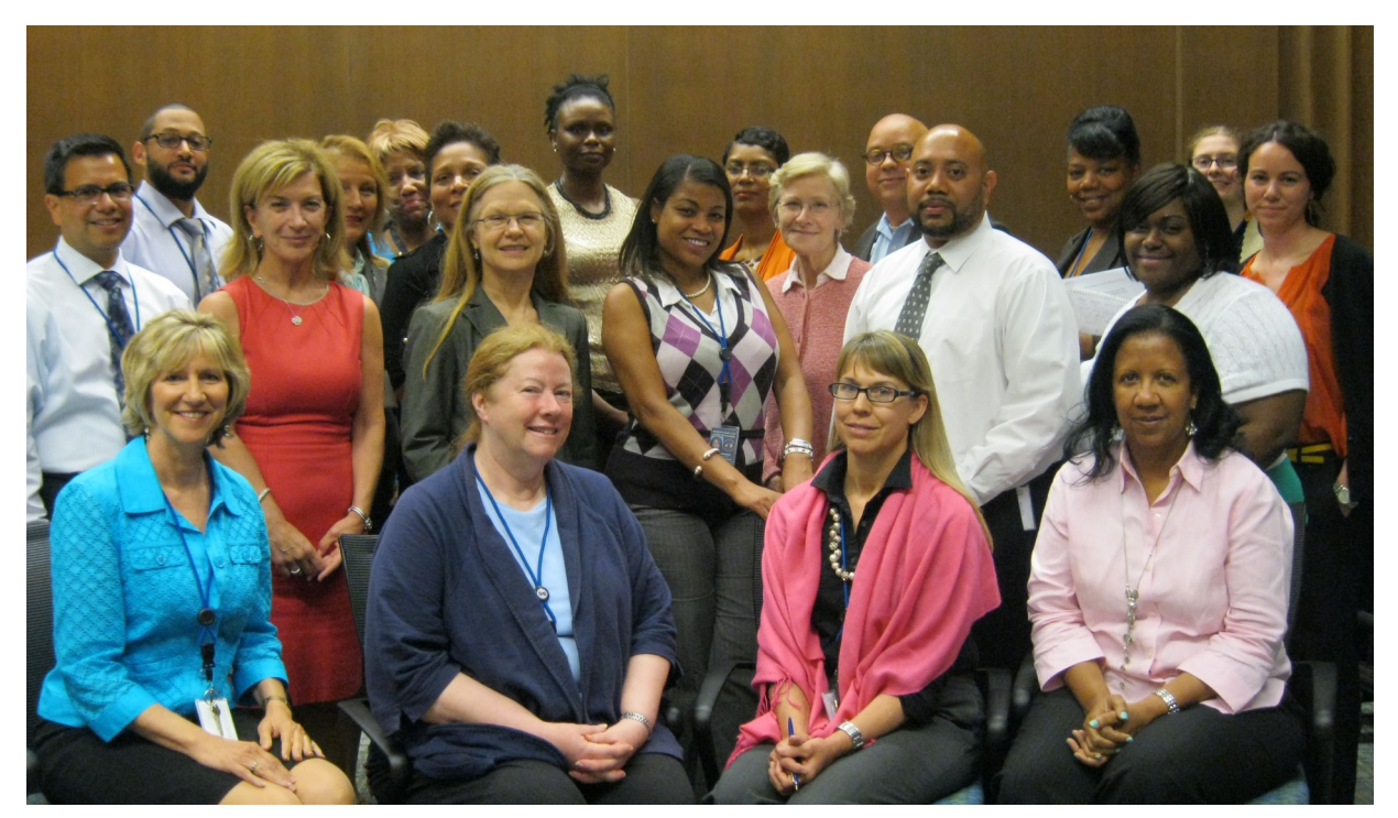
Members of the Multi-Door Dispute Resolution Division staff with the Director in June 2013.

In mediation, a neutral third party (the mediator) facilitates a discussion with the parties to explore possible solutions or settlements. The mediator does not give an evaluation or opinion of the case. Rather, the mediator prompts the parties to assess their relative interests and positions and to evaluate their own cases by the exchange of information, ideas, and alternatives for settlement. Mediations made up more than 99% of Multi-Door's case load in 2019.