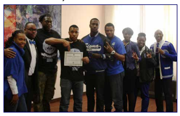
Recognizing the Phi Beta Sigma Fraternity.

The step exhibition was well attended by the DC Courts' staff where they were able to become educated about the rich history of the Black Greek Letter Organizations. Many Court employees are members of a Divine Nine organization and they proudly wore their Greek letters in support of this event. The step exhibition ended with food and fellowship as it concluded the Courts' Black History Month celebration.